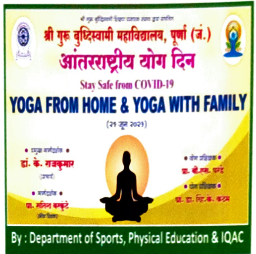
International Yoga Day (21 June 2021)